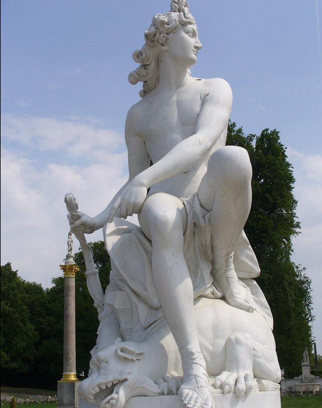
File:7003.Apollo mit dem getöteten Python(1752)-François Gaspard Adam-Große Fontäne-Sanssouci Steffen Heilfort.JPG